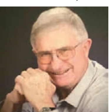
Merle Gilliland Photo provided